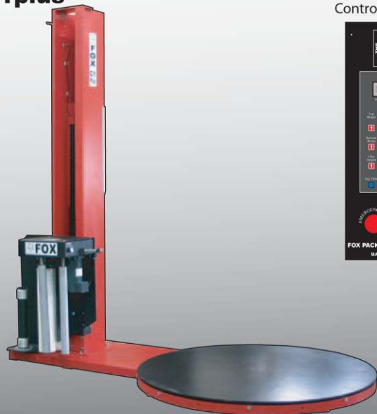
Control Panel Face