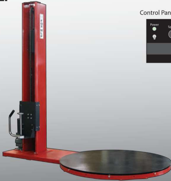
Control Panel Face