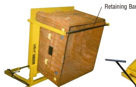
FLOOR LEVEL DUMPER