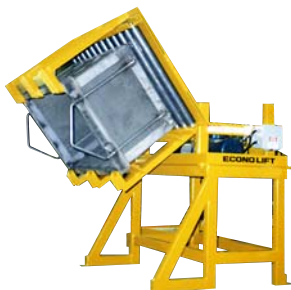
STATIONARY CONVEYOR DUMPER