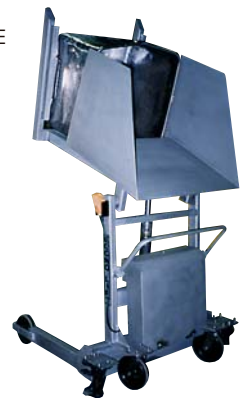
PORTABLE STAINLESS STEEL "V" MAG DUMPER