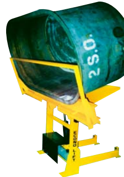
STATIONARY FORK OVERARM DUMPER FOR DUMPING PORTABLE CONTAINERS