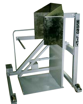
PORTABLE SIDE LOADING DUMPER WITH STAINLESS STEEL CHUTE