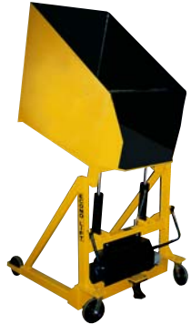
PORTABLE DUMPER W/NARROW DISCHARGE CHUTE