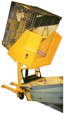
PORTABLE FORK OVERARM DUMPER