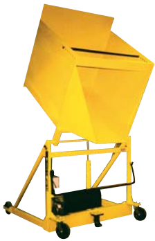
PORTABLE DUMPER W/ADJUSTABLE RETAINING BAR