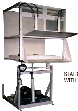
STATIONARY DUMPER WITH HYDRAULIC GATES