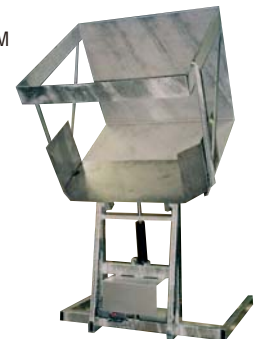
GALVANIZED DUMPER WITH STAINLESS CHUTE