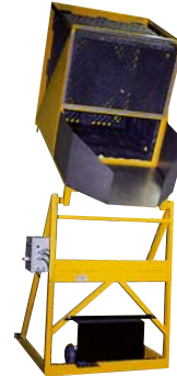
STATIONARY DUMPER W/STAINLESS DISCHARGE CHUTE & SPECIAL RETAINING SCREEN