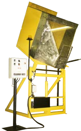
FULLY AUTOMATED DUMPER WITH MANUAL OVER RIDE AND "E" STOP