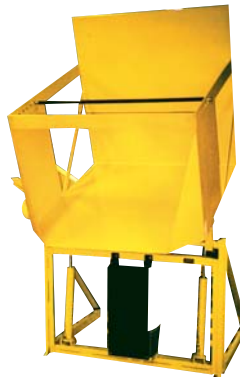
STATIONARY DUMPER W/ADJUSTABLE RETAINING BAR