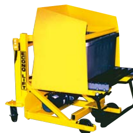
PORTABLE CONVEYOR DUMPER WITH CHUTE