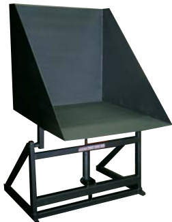
"STEEL-IT" PAINTED FOOD GRADE DUMPER