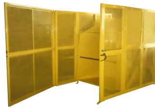
SAFETY GATE WITH LOCK OUT