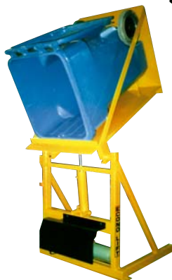
WHEELED CART DUMPER