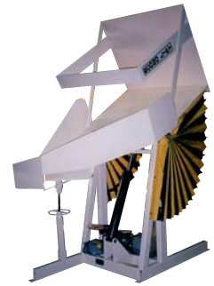
STATIONARY DUMPER WITH ADJUSTABLE CHUTE ATTACHMENT AND SAFETY SKIRTING